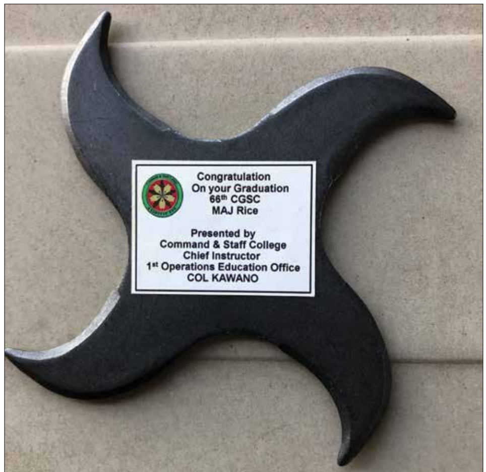
A coin presented to the author on the occasion of his graduation from the 66th Japanese Command and General Staff Course.

In the past several years, the JGSDF has shifted towards countering Chinese territorial expansion in the East China Sea. 38 Japan is paying particular attention to Chinese incursions near the Senkaku Islands, which Japan claims as its sovereign territory. 39 This priority led to the development of the first JGSDF Amphibious Rapid Deployment Brigade as a force to respond to hostile island takeovers. 40 Japan has also established new bases on the Japanese islands in the East China Sea and deployed surface-to-ship missile and surface-to-air missile batteries to those locations. 41 Of particular interest to the U.S. Army, the JGSDF possesses a significant and well-developed surface-to-ship missile capability 42 (a capability the U.S. Army has, until very recently, ignored). 43 The JGSDF has also adopted the “multi-domain” concept with what it refers to as “cross-domain operations,” which emphasize space, cyberspace, and electromagnetic capabilities. 44 Each of these new JGSDF endeavors provides new