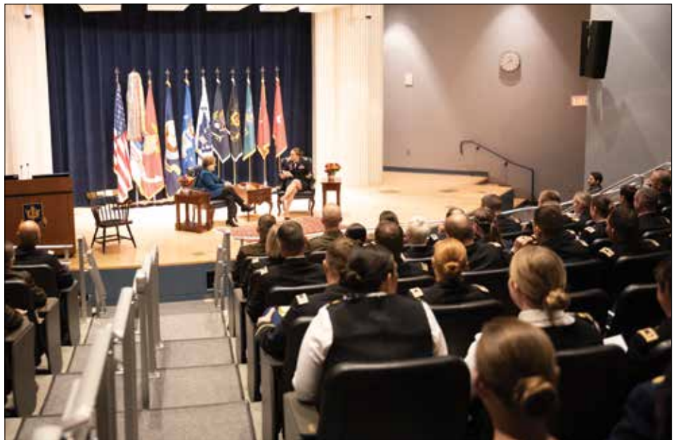
The Honorable Elena Kagan delivered the thirty-ninth Decker Lecture to staff, faculty, and students from both The Judge Advocate General's Legal Center and School and the University of Virginia School of Law.