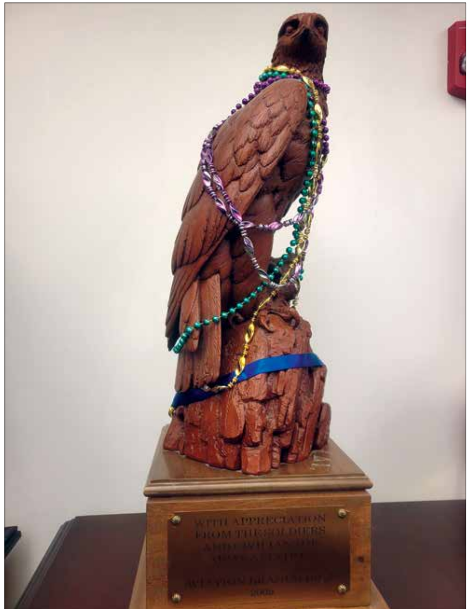
While a picture is worth a thousand words, the backstory of this eagle remains a mystery.

All branches report through the deputy chief to the chief of ALD. The division chief is the senior administrative law practitioner in the Army. Like all other assignments, leaders shape the experience; however, I believe that is more pronounced in the Pentagon, where every issue could be a “crisis” if the division chief treats it that way. The leadership billets are often, but not always, filled by individuals who previously served in an OTJAG division. Prior experience likely provides necessary perspective, knowing when to be “on,” and reassuring action officers that it is okay to be “off” at times.