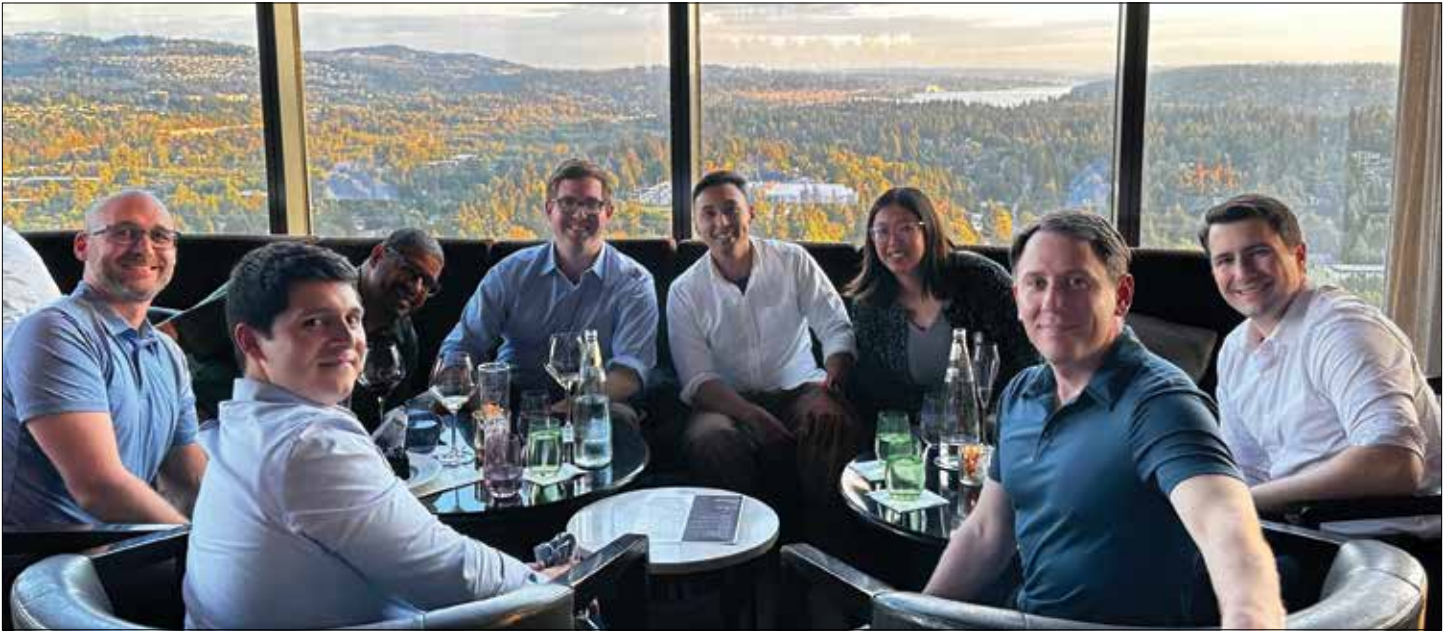
The author (seated center in the white shirt) attends a networking event with other former active-duty and current reserve JAs who are in private practice in the Seattle region.