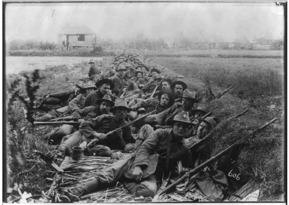
American Soldiers of the 20th Kansas Volunteer Infantry in trenches in the Philippines during the insurrection.

[T]he history of the United States . . . includes the activity of searching self-criticism as part of its foundational makeup. There is immense hope in that process if we go about it in the right way. That means approaching the work of criticism with construc-