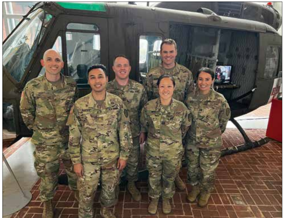
The author (second from left) attends Defense Counsel/Paralegal 101 in New Orleans with other Reserve and National Guard JAs from across the country.

As a reservist, I get to stay connected to other reservists from different parts of the country, practice in different areas of the law, and continue to be part of the JAG network. If there is a legal issue in a reservist's civilian practice, they now have a vast network of other legal professionals from whom they can learn. Moreover, if reservists' civilian work intersects, they now have peers with whom they can teach or attend a continuing legal education, jointly work on a pro bono matter, or find occasions to introduce each other to colleagues and extend their networks. Just like the legendary "third file" and by-name requests suggest, building and maintaining a great reputation is key. Those strong relationships where others, like your Reserve unit colleagues, will vouch for you remain priceless.