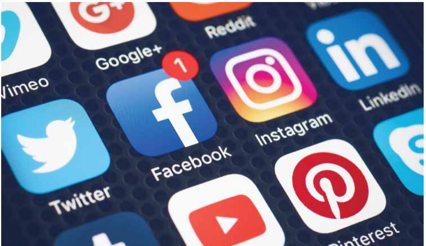
Planning for a high-profile investigation must include a public affairs strategy. No public affairs strategy is complete if it does not include social media engagement.

the identity of a suspect with the command or the media for fear that the suspect might become aware of the investigation and subsequently change their behavior. As another example, CID may not want the names of cooperating witnesses to be released out of concern for the witnesses' safety. These witnesses would also have certain privacy rights and would generally be protected from having their names released. 128