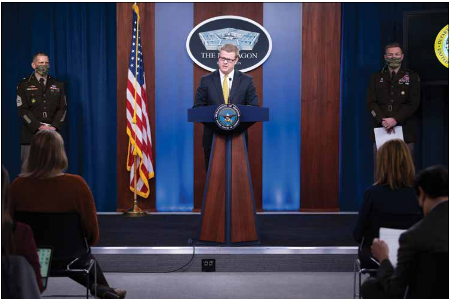
Army Secretary Ryan D. McCarthy briefs the media on the Fort Hood Independent Review, with SMA Michael A. Grinston, and Army Chief of Staff, GEN James C. McConville, at the Pentagon on 8 December 2020.

interest. 25 With this in mind, caring for the Family must be a commander's paramount concern. Caring for Family members is a high-stakes situation and getting it right can have the dual effect of addressing the Family's concerns while simultaneously fostering confidence in the command and the Army.