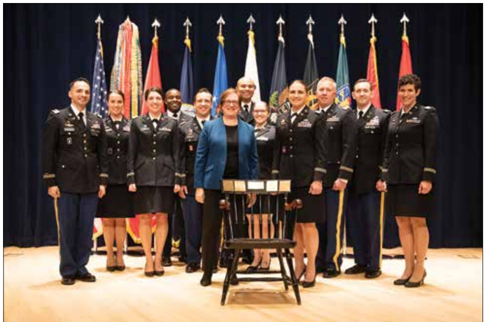
The Honorable Elena Kagan poses with the faculty of the Administrative and Civil Law Department.