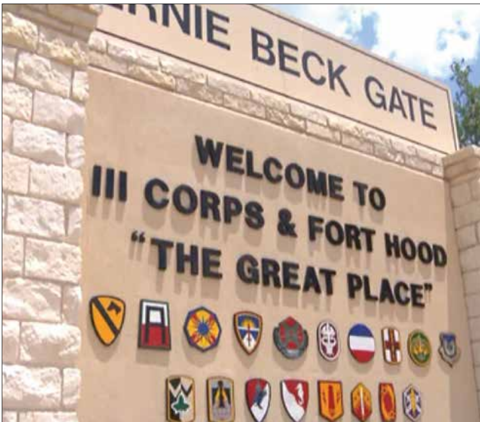
Photo image from KHOU news in Houston (dvids).

investigations and develop strategies to keep the public informed of the facts. This is important whether advocacy groups confront the command with deliberately deceptive content, known as disinformation, which should not be confused with unintentionally incorrect or misleading information, known as misinformation, in the form of viral storytelling.